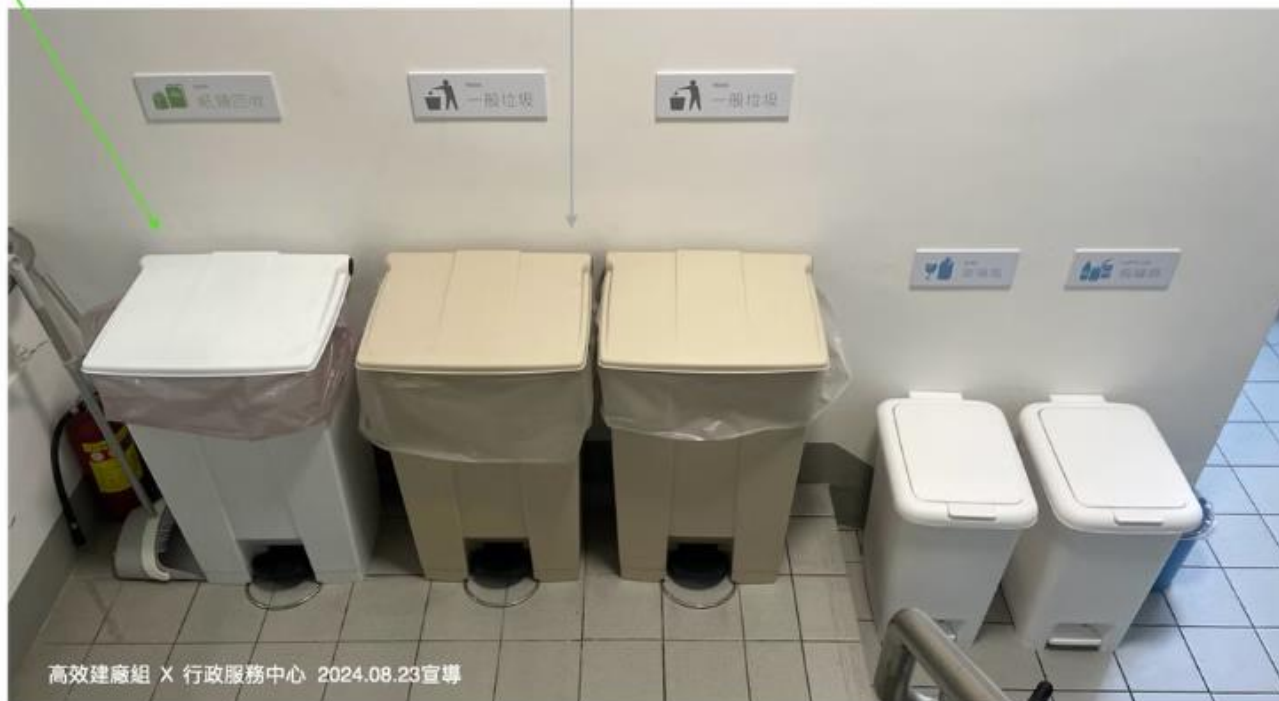
高效建廠組 X 行政服務中心 2024.08.23宣導